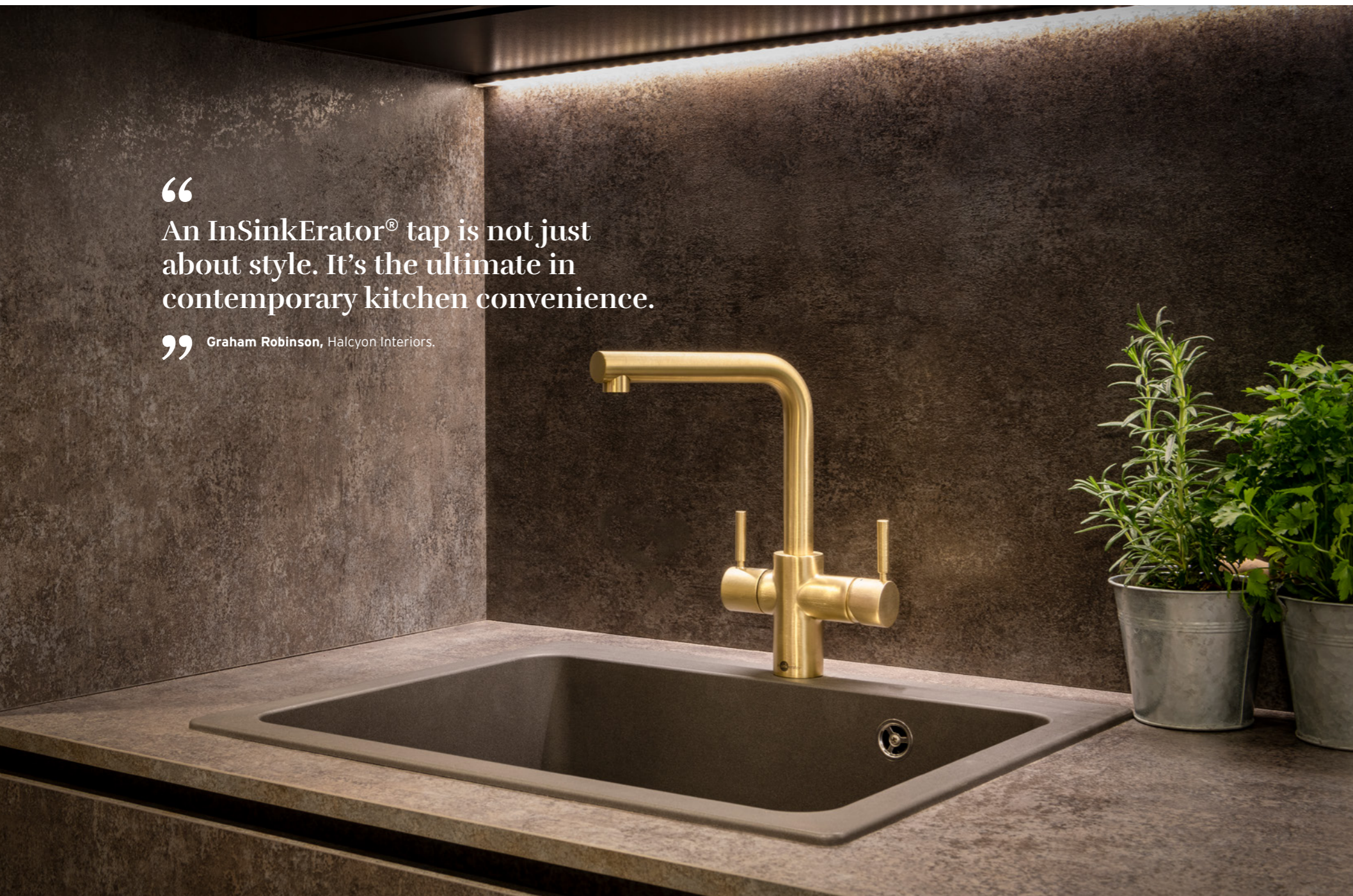
3N1 Brushed Gold, L Shape, Halcyon Interiors, London.

Long recognised as the market leader and world's largest manufacturer of food waste disposers, InSinkErator® has also established a strong and growing reputation for its high quality steaming hot water taps.