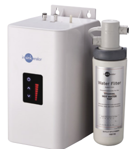
NeoTank® dimensions (mm): Height: 310. Width: 157. Depth: 206

Specially designed along with our filters to maximise the efficiency and longevity of InSinkErator® taps, the NeoTank delivers instant steaming hot water. The innovative 2.5 litre design features a digital touch screen thermostat control enabling users to set the water temperature between 88°C and 99°C, the perfect temperature for hot drinks.