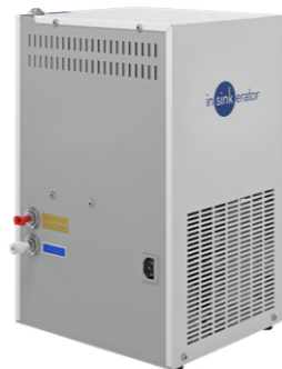
NeoChiller dimensions (mm): Height: 407. Width: 235. Depth: 260

The high performance under counter NeoChiller is compatible with our 4N1 and the additional HC1100, C1100, HC3010 and HC3020 taps. It dispenses perfectly chilled filtered water with no unpleasant taste and odours. It can dispense up to 7 litres per hour of cold still water between 3°C and 10°C eliminating bottled water or filter jugs, decluttering your kitchen.