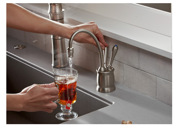
Tuscan - Special Edition Delivering just steaming hot or both steaming hot and cool drinking water, these premium traditional design 360 degree swivel taps make the perfect addition to any contemporary kitchen.

The Tuscan special edition is available in either polished chrome or a brushed steel finish.