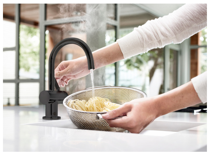
3300 - Special Edition Our modern black range taps are designed to complement premium modern kitchens.

The Tuscan special edition is available in either polished chrome or a brushed steel finish.