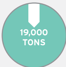
Reduction of residential food waste by 19,000 tons annually

Based on the results of the Clean Kitchen/Green Community demonstration project, households that had a new food waste disposer installed experienced a decrease in food scraps generation by one-third. If the entire City of Philadelphia utilized food waste disposers in homes and apartments similar to the target areas, potential benefits to the City could include: