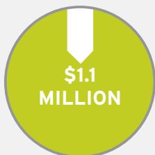
Reduction of waste disposal fees by $1.1 million annually