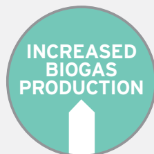
Increased biogas production by the Philadelphia Water Department